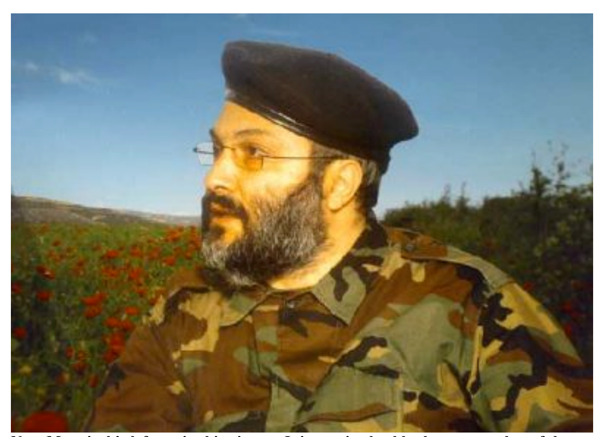
Note Mugniyeh's left ear in this picture. It is unmistakeably the same as that of the person in the first photo in this series, taken with Ayatollah Khamenei.